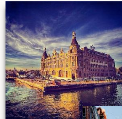
Haydarpaşa Train Station