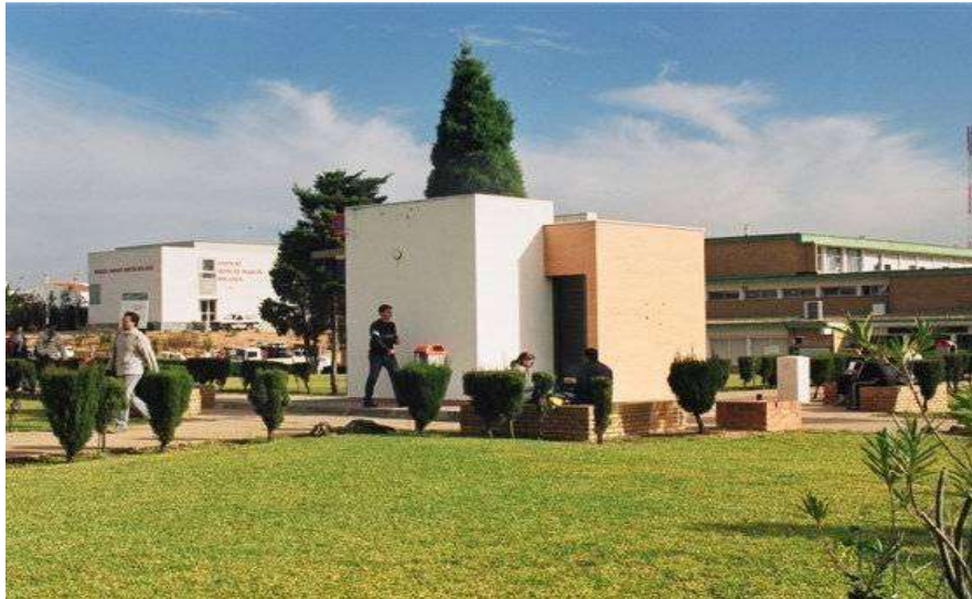
Campus La Rábida